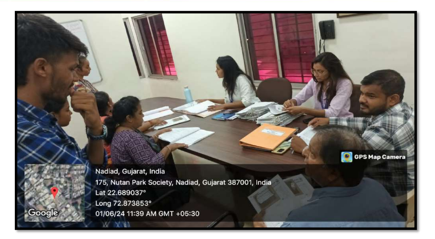
Discussion with Parent